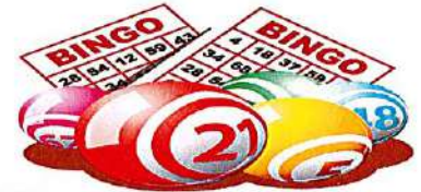
BINGO IS BACK!!!