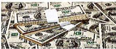
$20,000 in cash