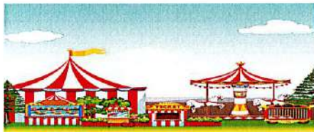
ENJOY RIDES & GAMES EVERY NIGHT

Enjoy all your favorite festival foods for which our parish festival is famous, including: red, potato, and spinach pizzas; sausage, meatball, chicken parm, hoagie and fried bologna sandwiches, smelts, chicken wings, calamari, french fries, hot dogs, pop, beer, lemon shakes, bakery booth, cavatelli & meatballs, and of course –our famous Cheese-puffs & Twists!